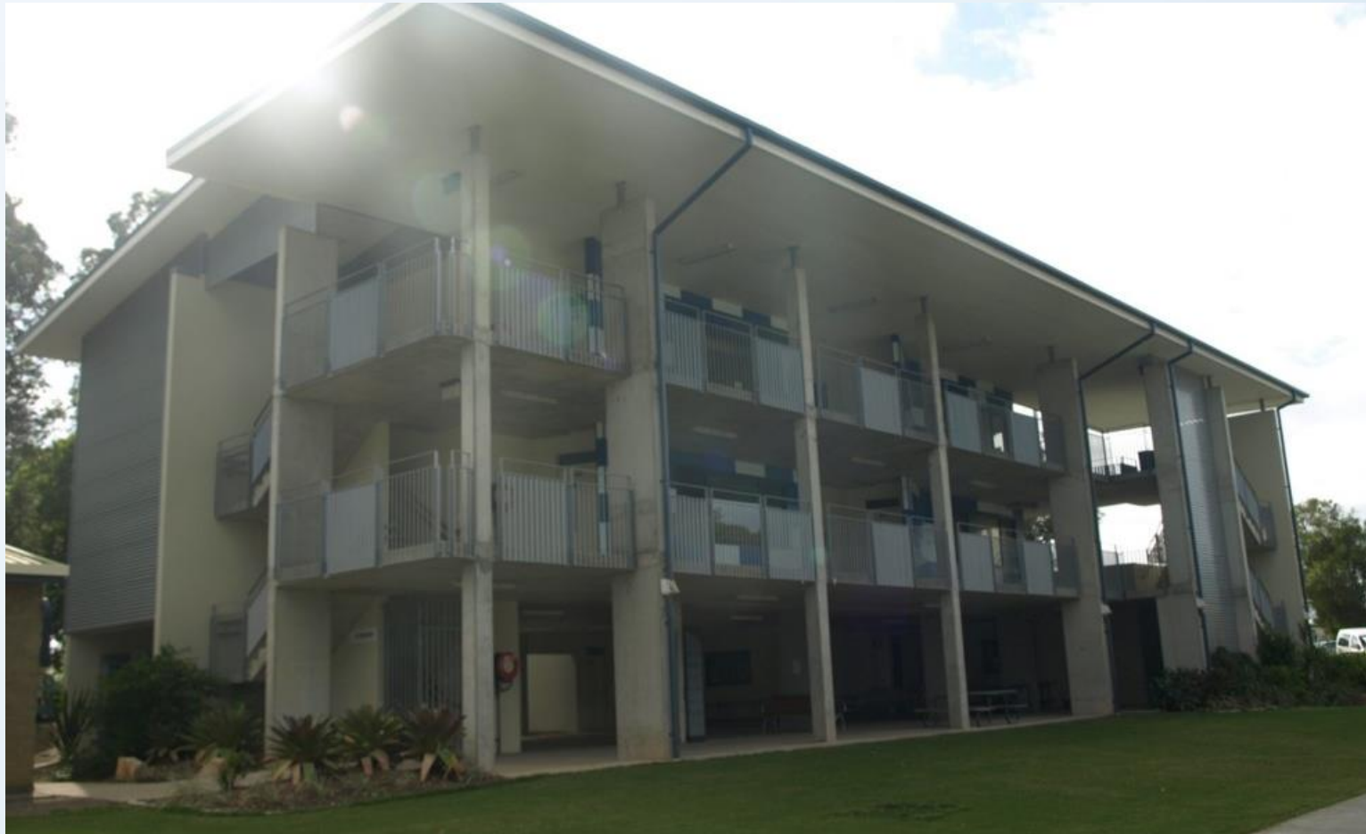
Middle School – G Block