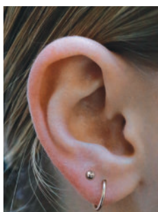
EARRINGS FOR SECONDARY GIRLS