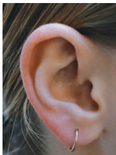
EARRINGS FOR PRIMARY GIRLS