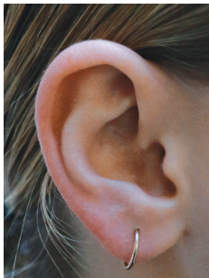
EARRINGS FOR PRIMARY GIRLS