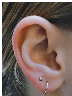
EARRINGS FOR SECONDARY GIRLS